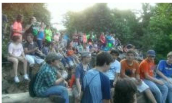
Campers gather at the old bridge on Rock Creek for many baptisms.