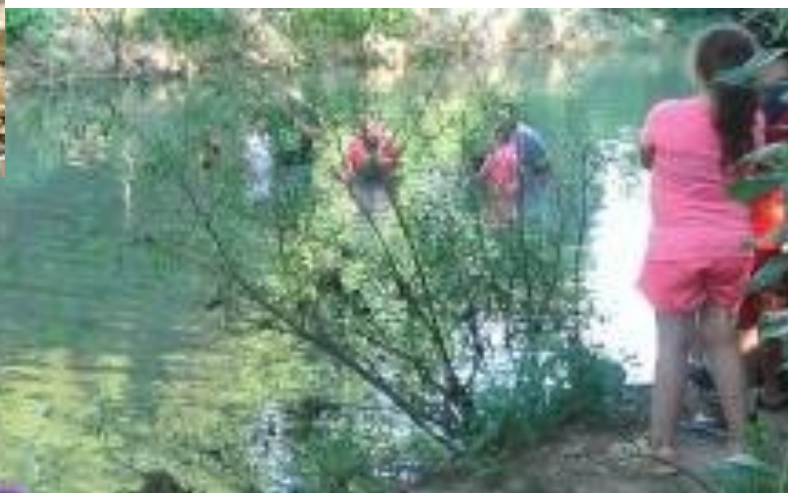
Baptisms in Rock Creek.