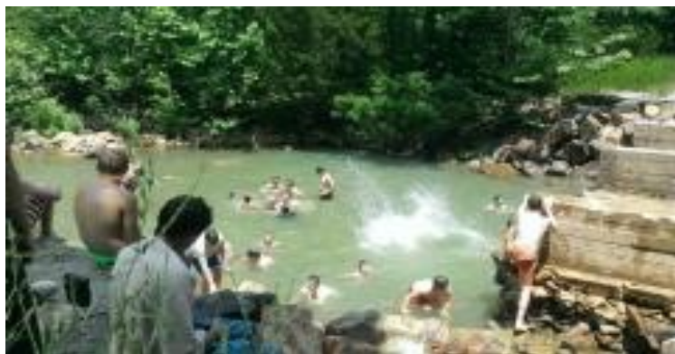
Swimming in Rock Creek.