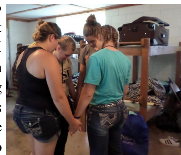
Girls praying in the dorm.